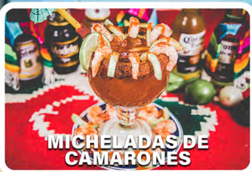
MICHELADAS DE CAMARONES