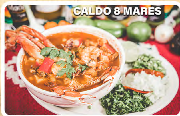
CALDO 8 MARES