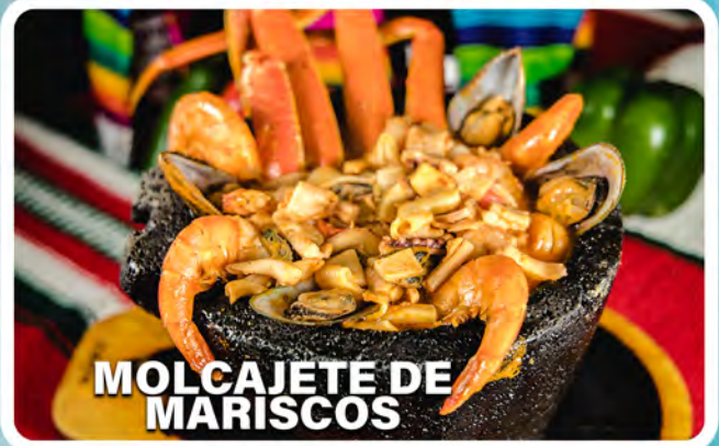
MOLCAJETE DE MARISCOS