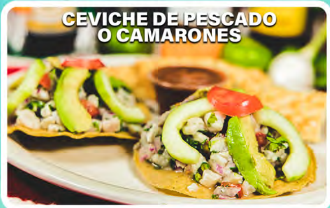
CEVICHE DE PESCADO O CAMARONES